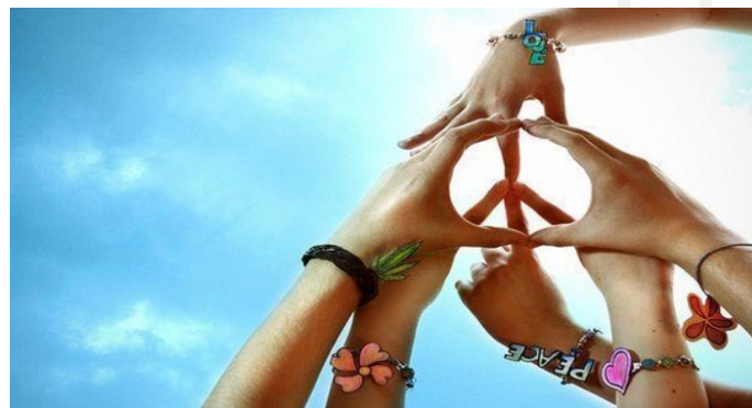
Figure 2. Peace photography by Fer Gregory