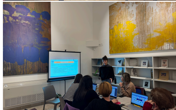
Photos from piloting in partner countries